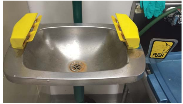
Sample eyewash station (above)

Eyewash stations should be regularly inspected and operated to ensure that they are functional before they are needed. A recent report from OSHA points out another reason to regularly operate eyewash stations: microorganisms.